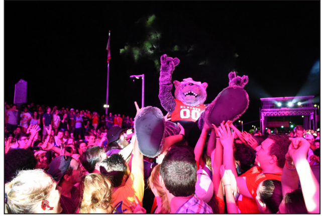
Mr. Wuf surfs through the crowd at the Spin Doctor's concert to cap off Packapalooza Aug. 19.