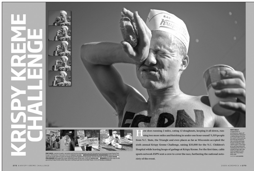
PHOTO CONTEST ENTRIES